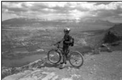
Richard Inman at top of Portal Trail on Poison Spider Mesa, overlooking Moab

make it into this area (west of the Colorado River), it would no doubt be another spectacular bike ride. Both the entrance to Canyonlands National Park and to Dead Horse Point State Park are only about 20 mi. from Hwy 191 that runs through Moab.