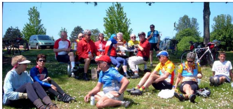
The late Saturday riders (Rollers) enjoying a picnic at Buena Vista Park