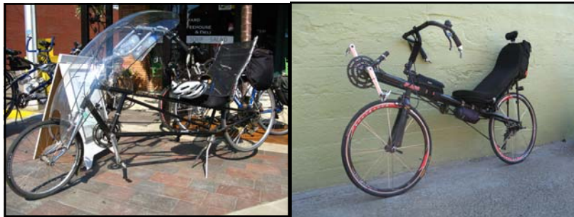
Long- (left) and short-wheelbase (right) recumbents

The brands and styles of recumbents ridden by members of the club cover the map. The brands include Rans, Tour Easy, Gold Rush, Actionbent, Challenge Fujin, Big-Ha, Cycle Genius, Bike-E, P-38, Grover, Burley, Bike Saturday, Bacchetta, home built recumbents and WizWheels Zoomer Elite, a tricycle.