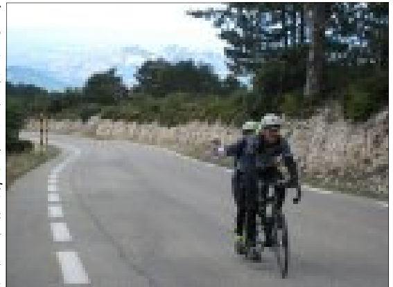
Climbing Mt Ventoux

O u r trip to France began a week earlier than the BAC ride with a base camp tour of some of the legendary climbs in the Pyrenees out of