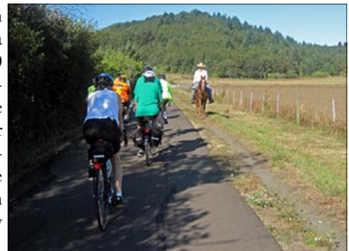
On the Midge Cramer Multi-Use Bike Path