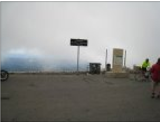
A cold day on top of Mt Ventoux

ever experienced, but liver is not my top choice. When I related my experience to a fellow traveller, he recounted his first dose of veal kidneys under similar circumstances years earlier. My companions enjoyed fish, and it, too, was excellent. Lesson one: read ALL the words. Lesson two: fish is a safe bet. Vincent van Gogh lived and did much of his work in St Remy, and en route to St Remy we found an interesting side tour of an old quarry site, with van Gogh images projected on the huge walls, accompanied by music; it was a great discovery. St Remy is the